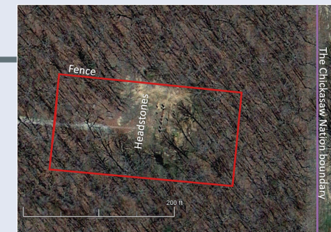
Map layers provided by Google Earth Pro 2012 aerial photography.

Aerial photography of the fence boundary (red rectangle), the Ella Allen Cemetery (visible headstones and shadow) and the eastern boundary of the Chickasaw Nation (purple line).