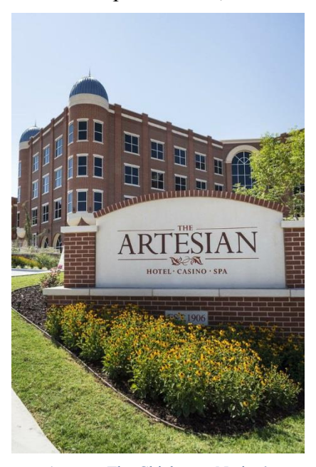
Figure 9: The Chickasaw Nation's Artesian Hotel Casino & Spa was opened in 2013, and it replaced the former Chickasaw Motor Inn.

located in Sulphur, Oklahoma (Lance, 2012). While many Chickasaw families owned businesses prior to this, the motor hotel was the tribe's first owned and operated business