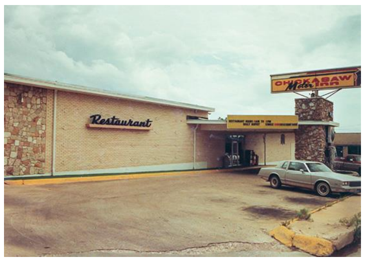
Figure 8: Photograph of the Chickasaw Motor Inn.

The History of Chickasaw Entrepreneurship