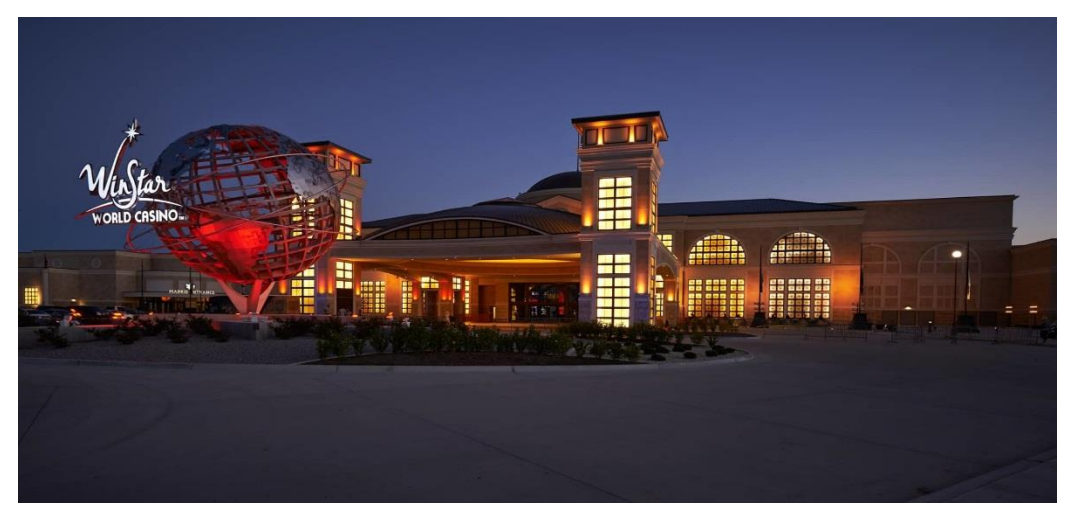
Figure 10: The WinStar World Casino, owned and operated by the Chickasaw Nation, is located in Thackerville, Oklahoma.

The Chickasaw Nation continues to provide for its citizens in all areas of life, including health care, nutrition, education, arts, culture and more. With more than 100 businesses, the tribe is economically strong, culturally vibrant and full of energetic people still dedicated to improving the lives of Chickasaws. The WinStar World Casino and Resort, the world's largest casino, is owned and operated by the tribe and has made a tremendous impact on the Chickasaw people and the state of Oklahoma. Opened in 2004, the casino now provides thousands of jobs for Chickasaws and non-Chickasaw citizens.