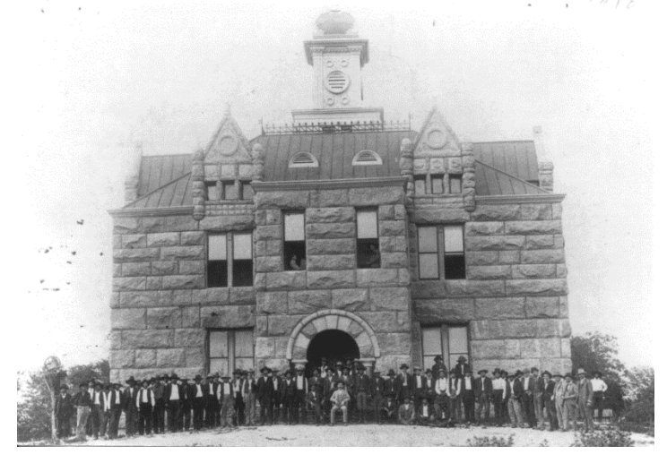
Figure 7: Chickasaw leaders pose in front of the newly constructed Chickasaw Capitol during the dedication ceremony in 1898.

These early entrepreneurial examples showcase the Chickasaws' willingness to provide for their own. The Colbert family was one of many Chickasaw families during the 1800s who utilized their businesses to improve the economic well-being and quality