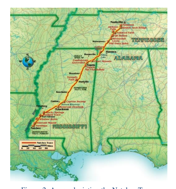
Figure 2: A map depicting the Natchez Trace, which goes from Natchez, Mississippi, to Nashville, Tennessee.

Similarly to the Natchez Trace, the rivers throughout the Southeast provided