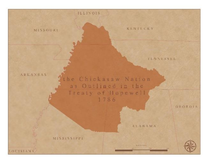
Figure 1: A map of the Chickasaw Homeland, consisting of parts of present-day Mississippi, Alabama, Kentucky and Tennessee.

Prior to Removal to Indian Territory in 1837, Chickasaws resided in their Homeland, consisting of parts of present-day Mississippi, Alabama, Kentucky and Tennessee. Throughout the Southeast, Chickasaws and other Southeastern Indians relied heavily on the Natchez Trace, ancient trails carved out by