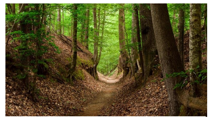
Figure 5: The Natchez Trace served as the early "highways" that weaved in and out of Chickasaw and other Southeastern Indian's homelands.

Additionally, the land was speculated by many to have new animals and contain large amounts of fertile soil and other natural resources. The news of the purchase and opportunities rapidly spread throughout the East Coast, and many Americans began traveling west to seek out the new possibilities. Traveling west, though, was no easy task. While the Southeast was home to beautiful mountains, prairie bluffs and ridges, it was also home to dense vegetation, thorny thickets and overgrowth. If an inexperienced traveler were to venture off the trails or to travel alone, it could ultimately mean death.