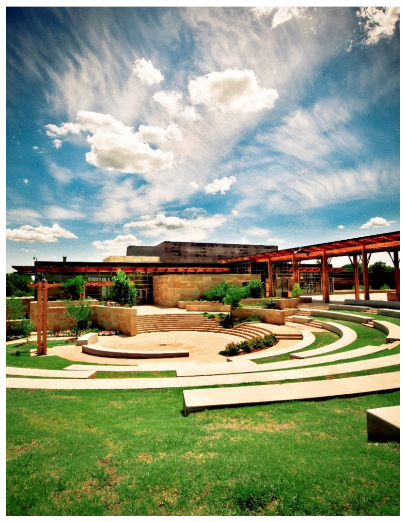
Figure 12: Image of the Chickasaw Cultural Center.

Indians and later Europeans in the Chickasaw Homeland, to strong business endeavors in Oklahoma, the Chickasaw Nation continues to strengthen the lives of its citizens through servant leadership, teamwork, a strong cultural identity and perseverance. All of which are qualities inherent in Chickasaw entrepreneurship.