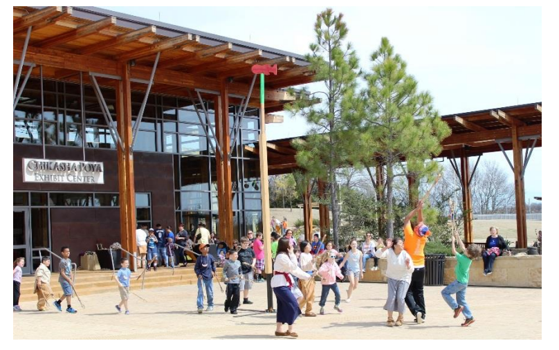
Figure 11: Visitors enjoying a game of stickball at the Chickasaw Cultural Center in Sulphur, Oklahoma.

partnerships. In 1987 when Bill Anoatubby was first elected Governor of the Chickasaw Nation, the tribe had 250 employees. Today, the tribe employs nearly 14,000 people, both Chickasaw and non-Chickasaw.