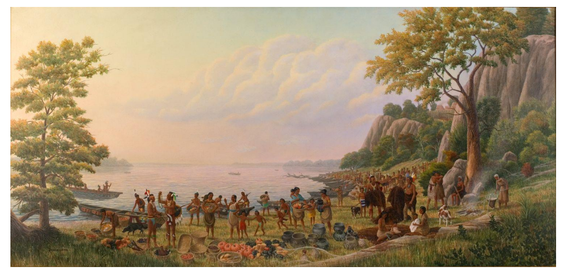
Figure 3: Tom Phillips' painting, "Bluffs Trade Fair," depicting the Chickasaws conducting a trade fair. The Chickasaws conducted trade fairs throughout the Southeast, trading resources and supplies with other Southeastern tribal groups along the Mississippi, Tennessee and Tombigbee rivers.

During trade fairs, families could trade items for desired goods, such as conch shells, copper, obsidian and turquoise, in addition to deer skin, pottery, bear grease and bows and arrows. Items were used for adornment and survival. These trade fairs were highly organized events that brought many tribes together.