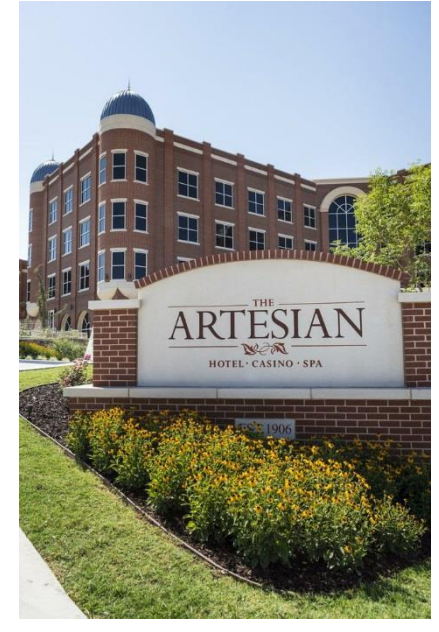
Figure 9: The Chickasaw Nation's Artesian Hotel Casino & Spa was opened in 2013, and it replaced the former Chickasaw Motor Inn.

owned and operated business as a whole. Forward-thinking Chickasaw leaders, including former Governor Overton James and current Chickasaw Nation Governor Bill Anoatubby, utilized Bureau of Indian Affairs' grants to renovate and remodel the facility.