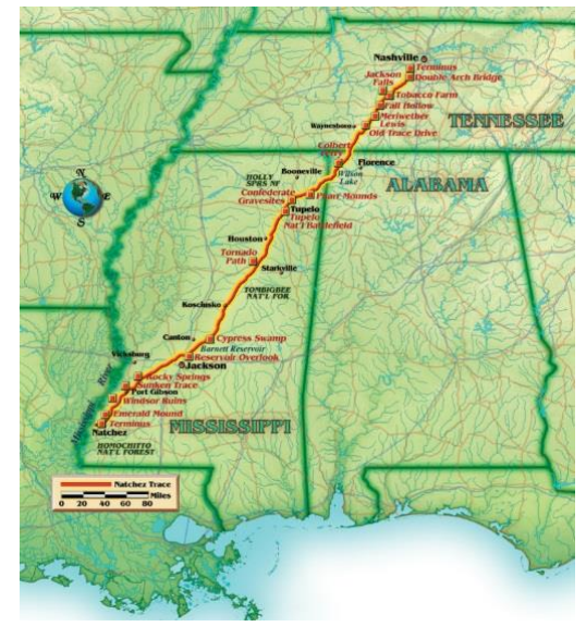
Figure 2: A map depicting the Natchez Trace, which goes from Natchez, Mississippi, to Nashville, Tennessee.

Similarly to the Natchez Trace, the major waterways throughout the Southeast