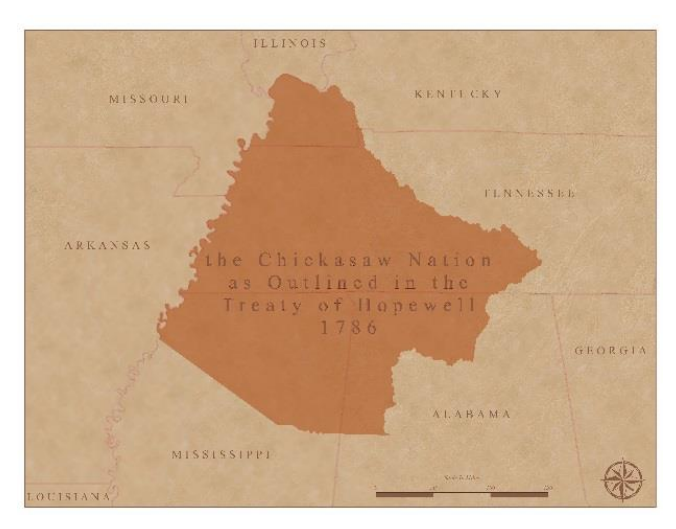
Figure 1: A map of the Chickasaw Homeland, consisting of parts of present-day Mississippi, Alabama, Kentucky and Tennessee.

Prior to Removal to Indian Territory in 1837, Chickasaws resided in their Homeland, consisting of parts of present-day Mississippi, Alabama, Kentucky and Tennessee. Throughout the Southeast, Chickasaws and other Southeastern Indians relied heavily on the Natchez Trace, ancient trails carved out by