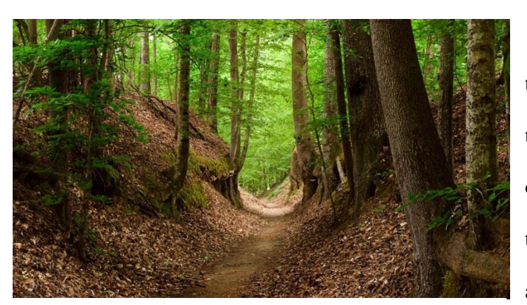
Figure 5: The Natchez Trace served as the early "highways" that weaved in and out of Chickasaw and other Southeastern Indian's homelands.

Additionally, the land was speculated by many to have new animals and contain large amounts of fertile soil and other natural resources. The news of the purchase and opportunities rapidly spread throughout the East Coast, and many Americans began traveling west to seek out the new possibilities. Traveling west, though, was no easy task. While the Southeast was home to beautiful mountains, prairie bluffs and ridges, it was also home to dense vegetation, thorny thickets and overgrowth. If an inexperienced traveler were to venture off the trails or to travel alone, it could ultimately mean death.