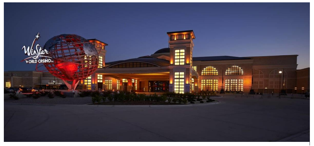
Figure 10: The WinStar World Casino, owned and operated by the Chickasaw Nation, is located in Thackerville, Oklahoma.

The tribe continues to expand its business ventures to include businesses such as a chocolate factory, cultural center and other professional services, led by Chickasaw Banc Holding Co., which operates Bank2 in Oklahoma City, and Chickasaw Nation Industries,