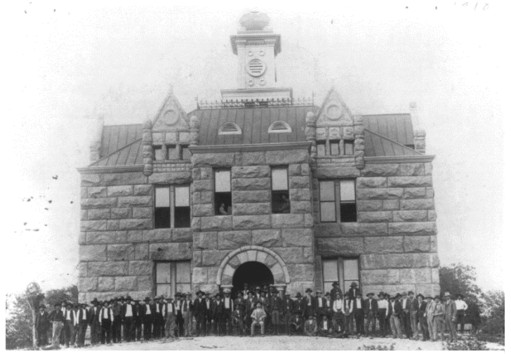
Figure 7: Chickasaw leaders pose in front of the newly constructed Chickasaw Capitol during the dedication ceremony in 1898.

provide for their own. The Colbert family was one of many Chickasaw families during the 1800s who utilized their businesses to improve the economic well-being and quality of life for their families. However, after the passage of the Indian Removal Act in 1830,