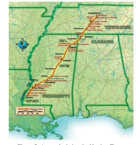
Figure 2: A map depicting the Natchez Trace, which goes from Natchez, Mississippi, to Nashville, Tennessee.

Similarly to the Natchez Trace, the major waterways throughout the Southeast