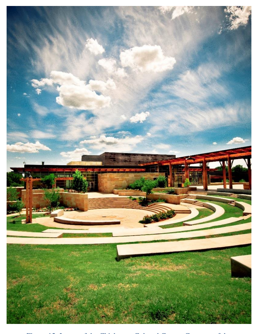
Figure 12: Image of the Chickasaw Cultural Center.

Indians and later Europeans in the Chickasaw Homeland, to strong business endeavors in Oklahoma, the Chickasaw Nation continues to strengthen the lives of its citizens through servant leadership, teamwork, a strong cultural identity and perseverance. All of which are qualities inherent in Chickasaw entrepreneurship.