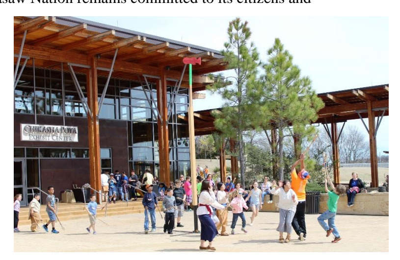
Figure 11: Visitors enjoying a game of stickball at the Chickasaw Cultural Center in Sulphur, Oklahoma.

partnerships. In 1987 when Bill Anoatubby was first elected Governor of the Chickasaw Nation, the tribe had 250 employees. Today, the tribe employs nearly 14,000 people, both