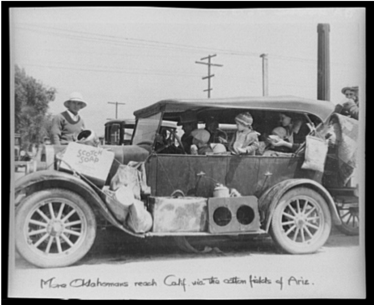
More Oklahomans reach Calif. via the cotton fields of Ariz.