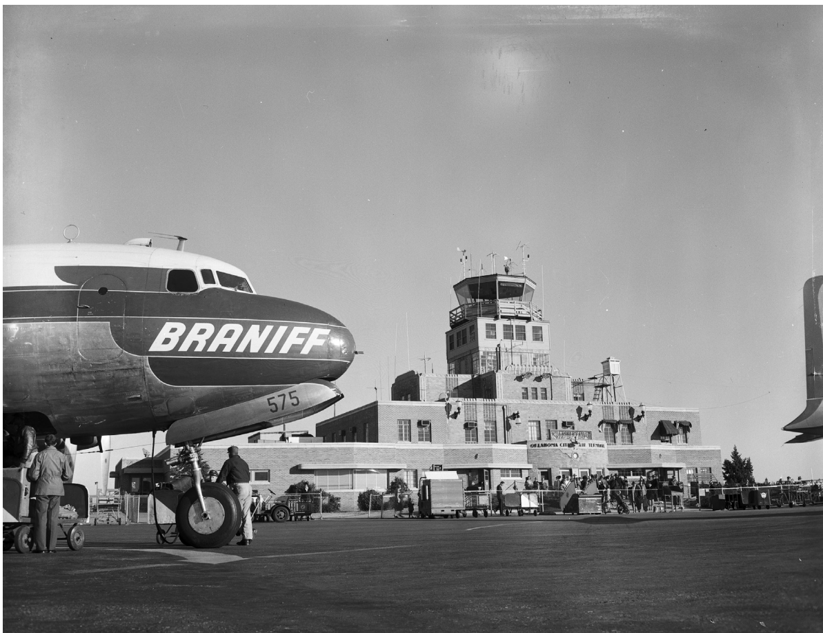
W I L L R O G E R S W O R L D A I R P O R T