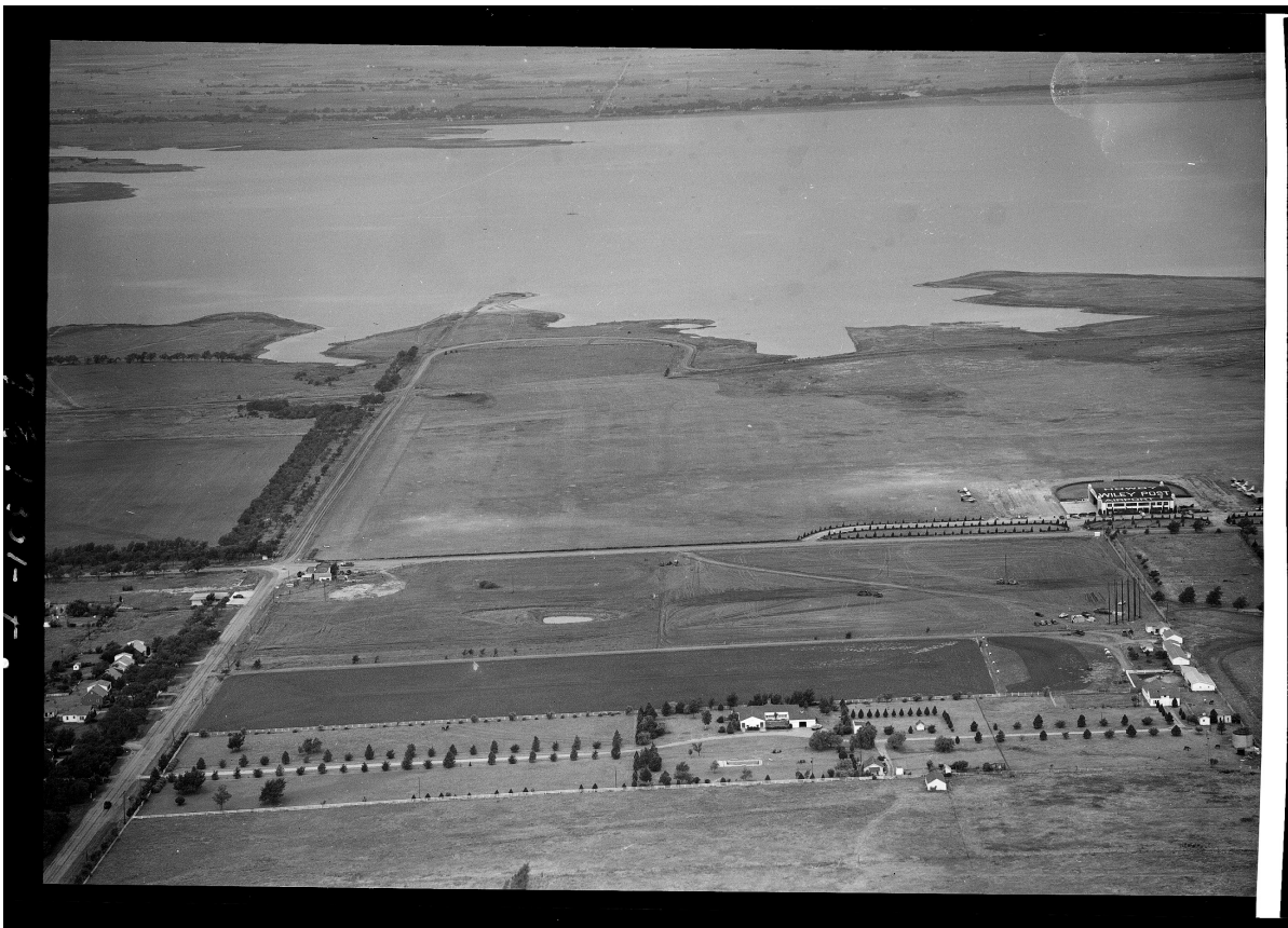
W I L E Y P O S T A I R P O R T