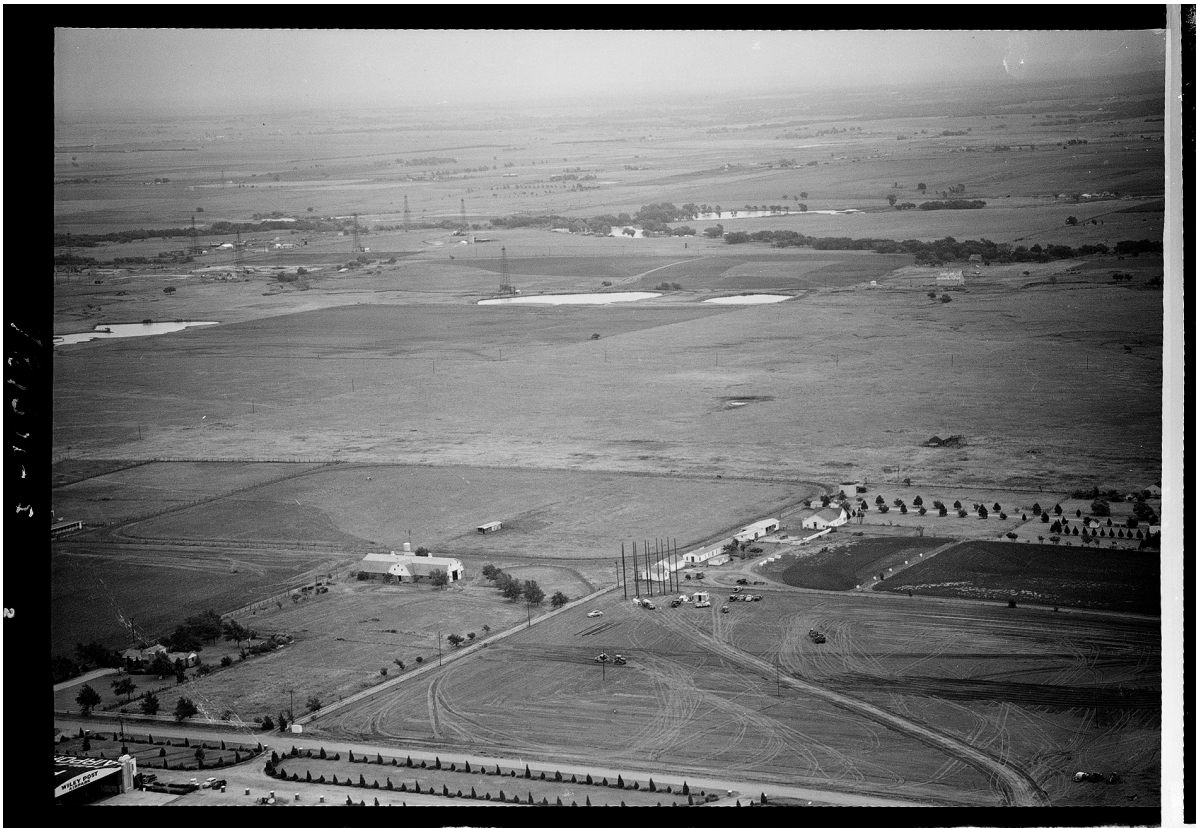
W I L E Y P O S T A I R P O R T