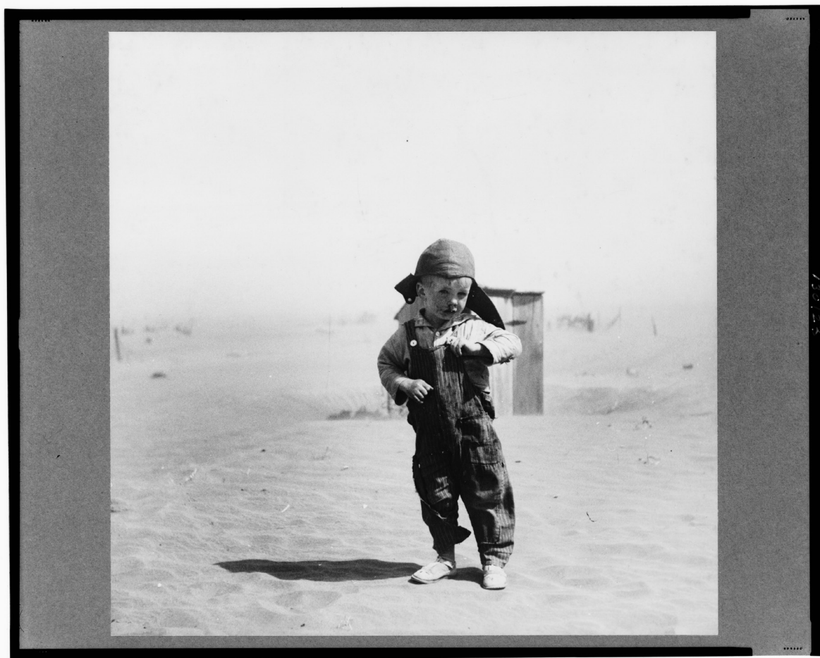
T H E D U S T B O W L