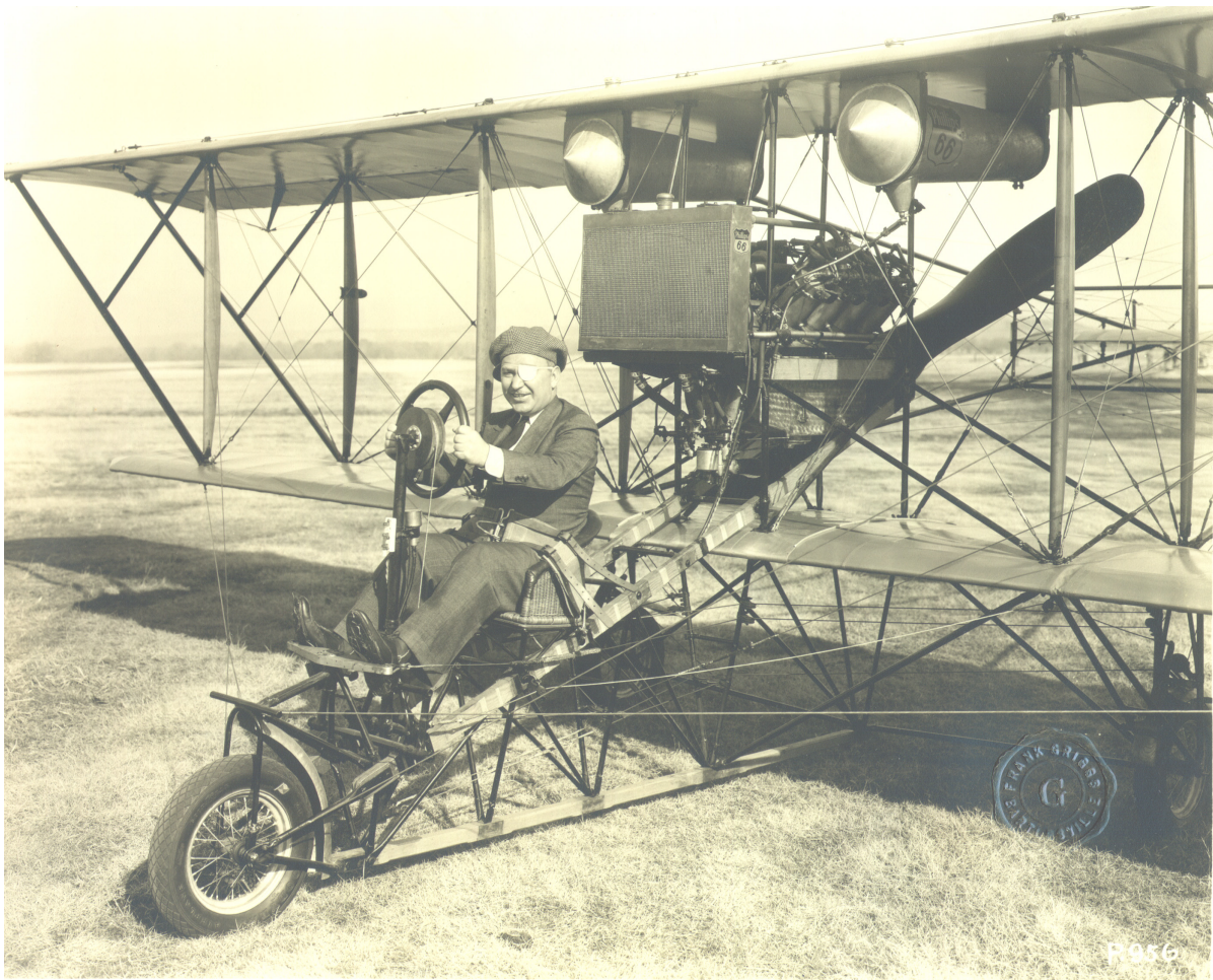
E A R L Y D A Y P L A N E