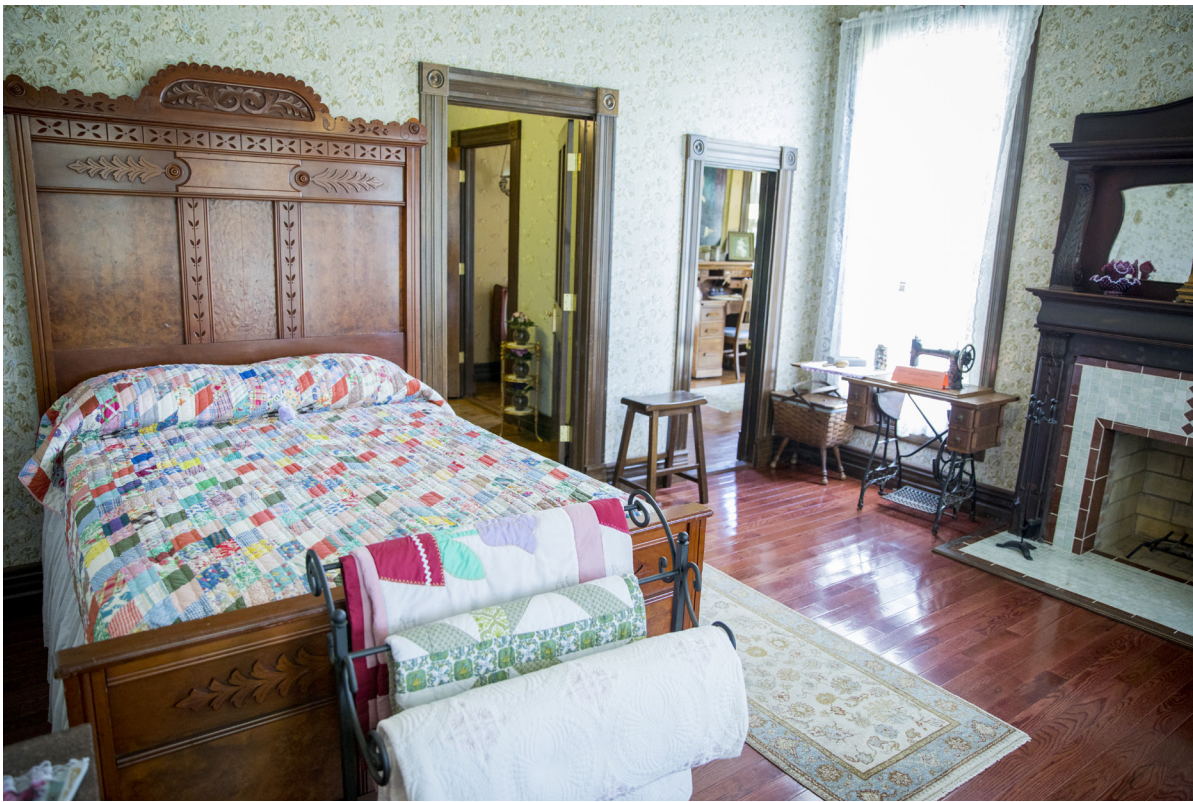
C H I C K A S A W W H I T E H O U S E