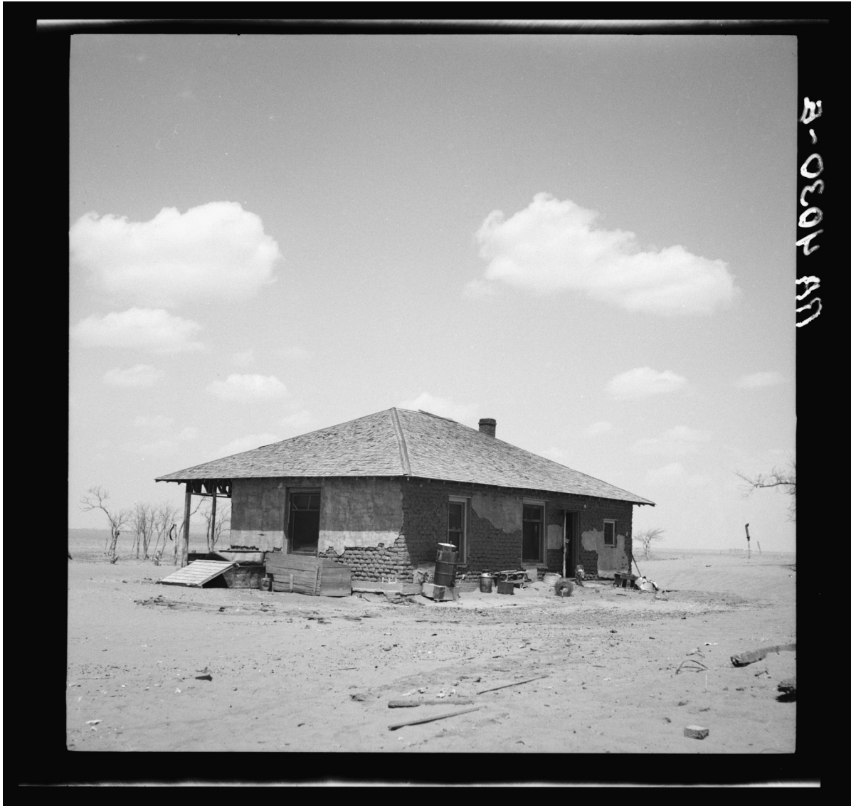
THE DUST BOWL