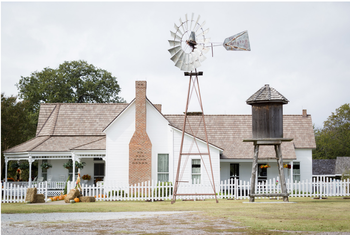
C H I C K A S A W W H I T E H O U S E