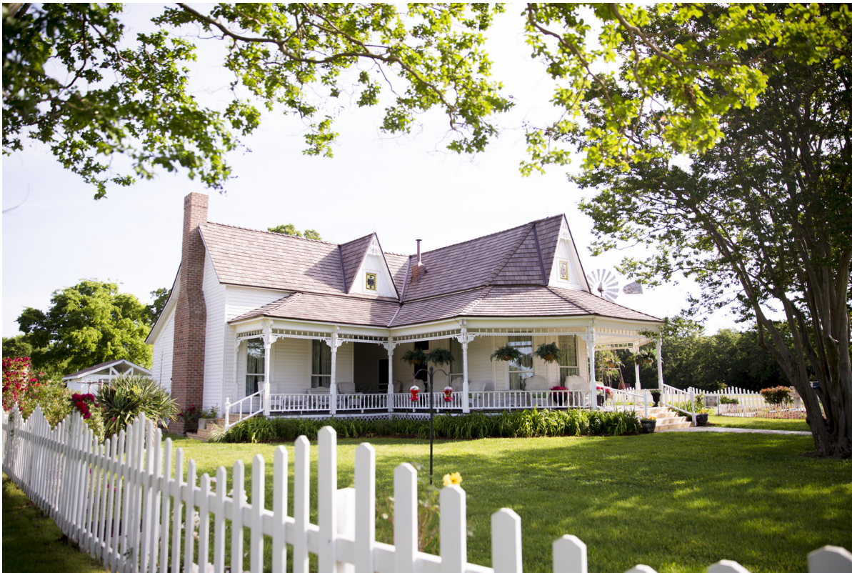
C H I C K A S A W W H I T E H O U S E