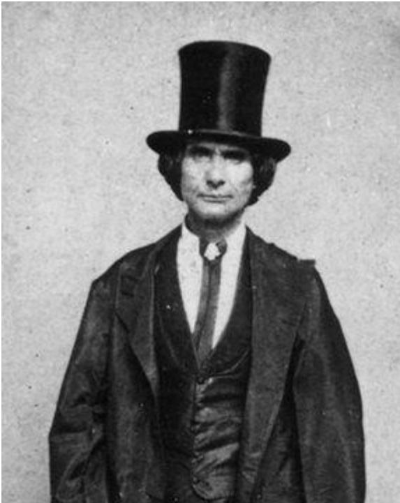
Figure 3: Gov. Winchester Colbert

rode straight to Governor Colbert's home in hopes of finding him there. When they found he had escaped to Texas just hours before and that they were unable to catch him, they torched his home and fields leaving nothing for him to come back home to. Colonel Phillips then sent letters written in red ink to each of the leaders of the Five Civilized Tribes in hopes of persuading them to surrender the Confederate cause. Governor Colbert stayed in Texas until the end of the war.