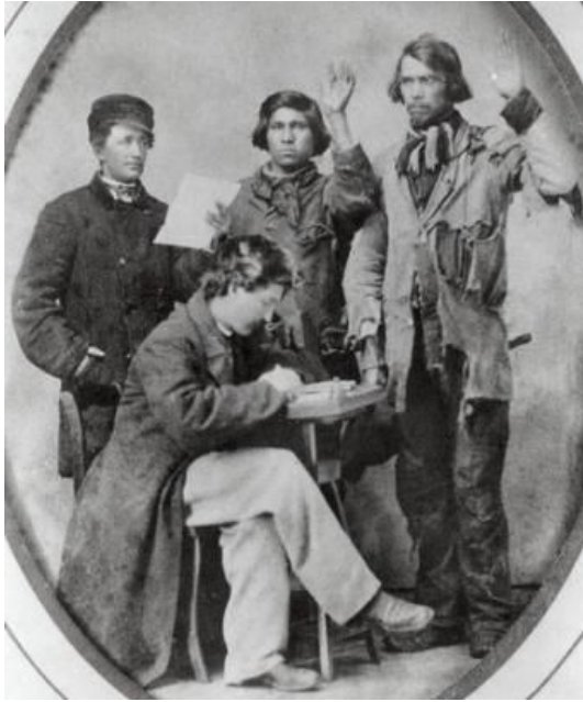
Figure 1: U.S. Col. William Weer seated here swearing in Indian volunteers.

There were a few forts in Indian Territory prior to the beginning of the Civil War.