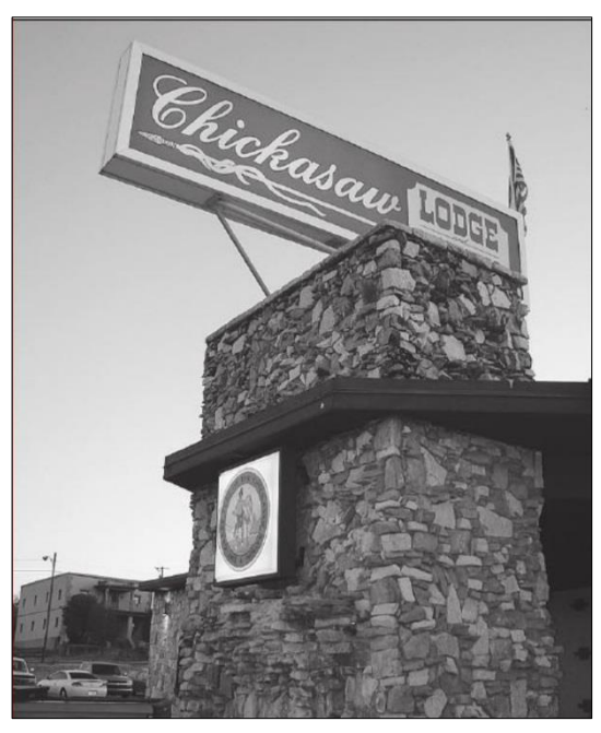
Figure 2: The Chickasaw Motor Inn in Sulphur, OK

Chickasaw Nation in 1963 he take his oath of office there, at Seeley Chapel, where the grassroots movement had begun.