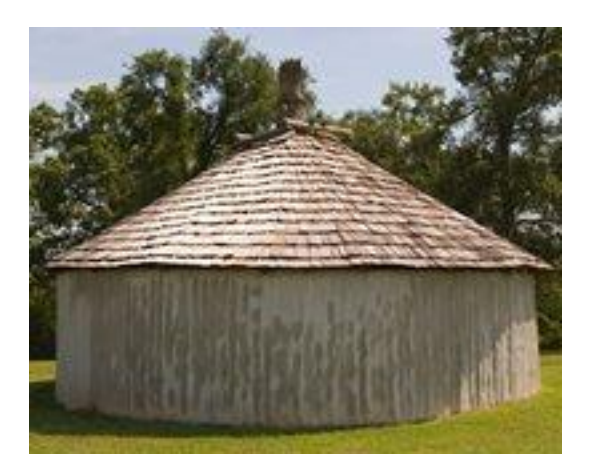
Figure 4: Chickasaw Winter House.

Before European contact, the influence of Christianity and Chickasaw Removal, American Indian belief systems mirrored Christianity in some ideals. The Chickasaws believed there was one great creator Aba'Binni'li' (Ah-bah-bin-nih-LEE'), one who sits above, who made everything, from the sky, to mother Earth and to the