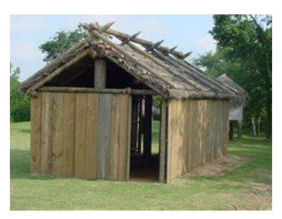
Figure 3: Chickasaw Summer House.

Unlike most Plains tribes, the Chickasaws did not live in tipis/tee-pees or move around constantly. Each household consisted of a summer house and a winter house, and Chickasaw families would switch at the beginning of each season. The winter house was circular, well-insulated and built to protect them from extreme elements and