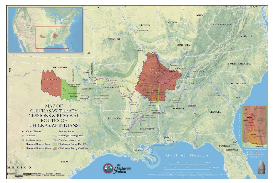
Figure 1: Map of Chickasaw treaty cessions and removal routes.

The Chickasaw's historic homeland boundaries consist of areas located in present-day Mississippi, Alabama, Kentucky and Tennessee. One important aspect of their homelands included the use of natural resources, including the waterways, which they used as a source for food, transportation, a means for trading, protection against raiding tribes and Europeans, and for religious practices. James Atkinson, author of Splendid Land, Splendid People , (2004), noted that from remote times, the American Indian people of the southeast built secure homes, obtained sustenance from the land, made comfortable clothing, and constructed efficient tools, weapons, adornments and household items from the natural resources.