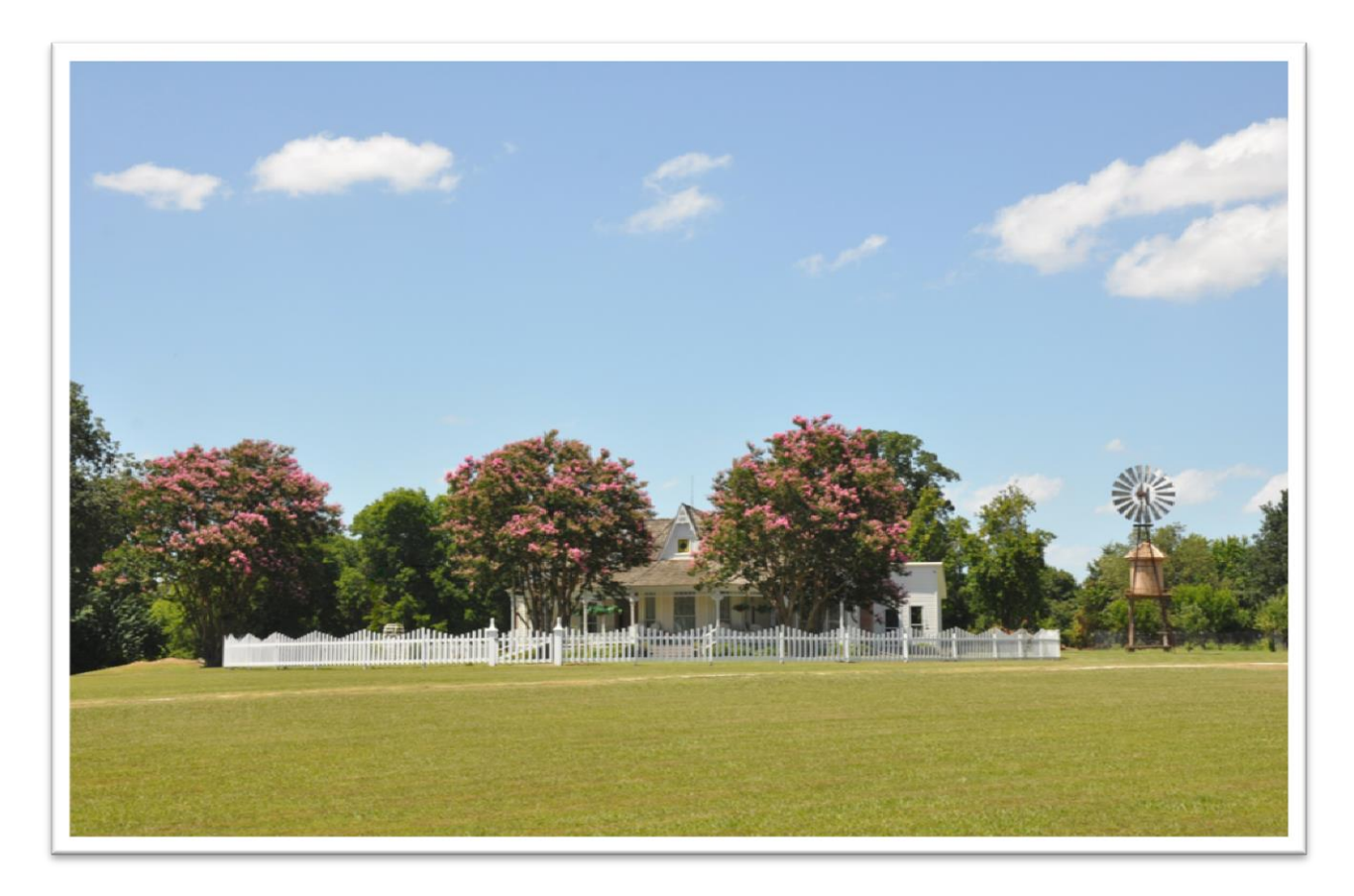
Figure 10: The Chickasaw White House today

By 2004, the tribe began the physical labor of the restoration process. After the stabilization of the foundation, workers took the house apart, saving all usable original components for the restored structure. Original doors, floors, hardware and woodwork were carefully separated from debris as the structure was dismantled. The salvageable material was restored, while unusable pieces became patterns for new counterparts. It took more than two years of steady work to complete the home. Now that it's repaired and rejuvenated, the Chickasaw White House is ready to continue into the next 100 years, helping to educate people about the history of the Chickasaw Nation.