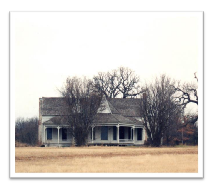
Figure 9: The Chickasaw White House before

restoration chair that belonged to Douglas, Jr.