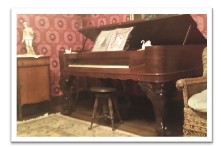
Figure 8: The family piano

The parlor was perhaps the most important room in the house. One of the features of this room is the hand-blocked wallpaper with original pattern. Governor Johnston signed many historic legal documents on the oak library table. Another original piece is