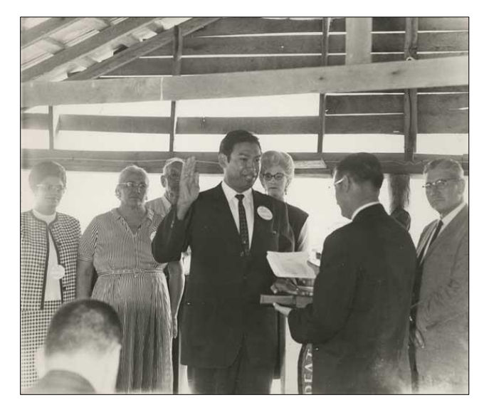
Figure 1: Gov. James being sworn in at Seeley Chapel in October of 1963.

In 1856, the Chickasaw people gathered at Good Spring (known today as Tishomingo, Oklahoma) on Pennington Creek to write their own constitution. It provided for a three-branch system of government—executive, legislative and judicial. With minor changes over the years, this document served the Chickasaw people well until its dissolution in 1906 in preparation for Oklahoma statehood. From 1906 until 1971,