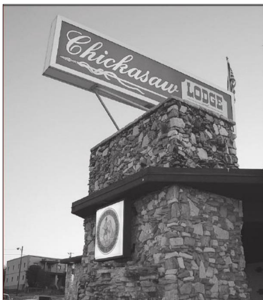
Figure 2: The Chickasaw Motor Inn in Sulphur, Oklahoma

Nation in 1963, he took his oath of office at Seeley Chapel, where the grassroots movement had begun.